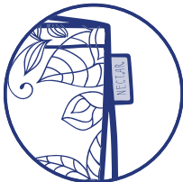
Custom Woven Tag

Additional packaging and Add-Ons may be available. Please contact your Sales Rep for more information.