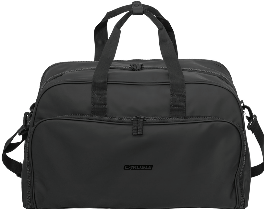
B6210 CALL OF THE WILD WEEKENDER BRANDING METHOD: SILKSCREEN

See something you like? Want more ideas? Email marlene@apexadv.com today!