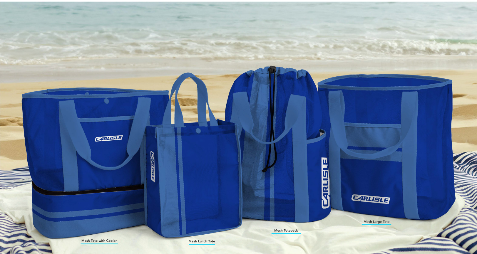
Mesh Tote with Cooler

Jump on these new takes on a classic, perfect for warm weather and outdoor events, the Mesh Bag Collection allows for full-color designs on a unique mesh fabric, sure to make a big splash!