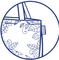
Custom Woven Tag

Additional packaging and Add-Ons may be available. Please contact your Sales Rep for more information.