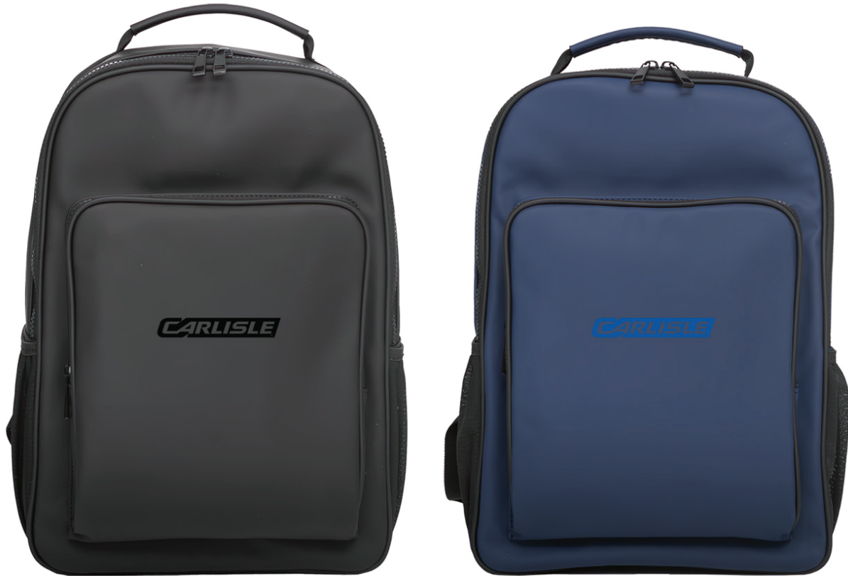
BG126 ROAM LITE 15.5" LAPTOP BACKPACK CALL OF THE WILD BRANDING METHOD: SILKSCREEN

See something you like? Want more ideas? Email marlene@apexadv.com today!