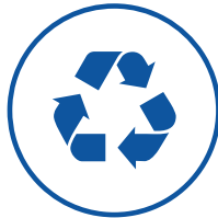
Upgrade to Recycled Material

Additional packaging and Add-Ons may be available. Please contact your Sales Rep for more information.