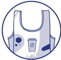
Pantone Matched Piping