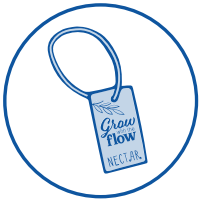
Full-Color Hang Tag