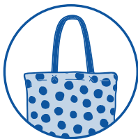
Pantone-Matched Webbing Handles