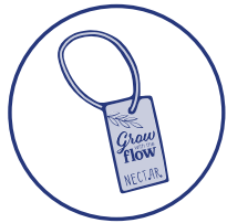
Full-Color Hang Tag