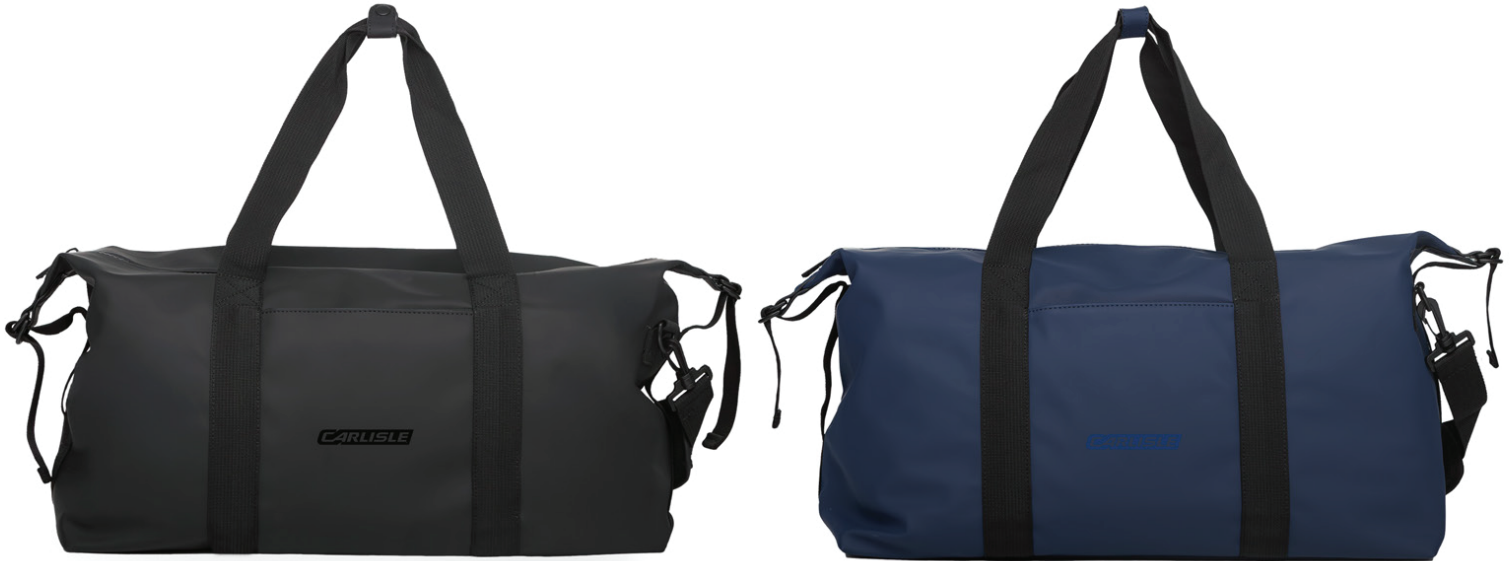
BG213 DRIFT DUFFLE CALL OF THE WILD BRANDING METHOD: SILKSCREEN