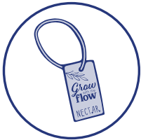
Full-Color Hang Tag